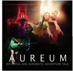
AUREUM: AERIAL ADVENTURE Saturday, June 18 2:00pm & 7:30pm Knox Memorial