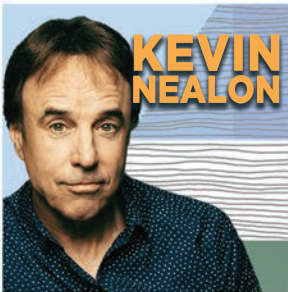
KEVIN NEALON Thursday, June 16 8:00pm Woodward Opera House