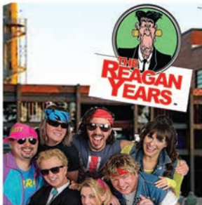
THE REAGAN YEARS Friday, June 17 7:30pm Ariel-Foundation Park